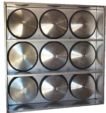
Below: Multiple dampers in a 3 high by 3 wide configuration.